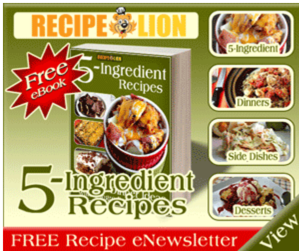
5 Super Easy Recipes