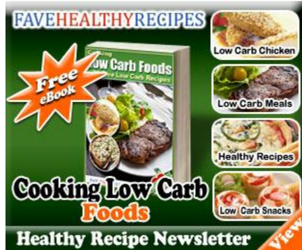
Free Low Carb Recipes