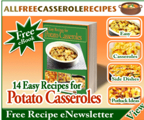
14 Easy Recipes for Potato Casseroles